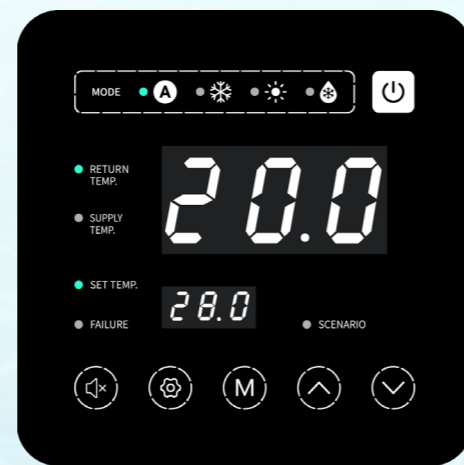
Features an intuitive coloured LCD touchscreen for clear and simple operation.

*Visit pentairpool.com.au for full warranty terms and conditions.