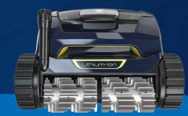
FR2000 iQ WR000508