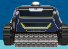
FR500 iQ WR000630