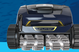
FR1000 iQ WR000527