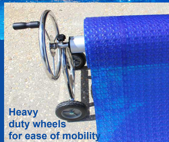
Heavy duty wheels for ease of mobility

The Roller also features 100mm centre tube for strength. Durable design and long lasting components. An easy to use product that will offer years of trouble free service.